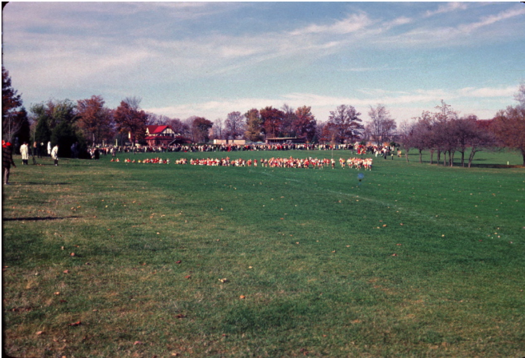
The start, Champaign/Urbana Golf Course, November 4, 1961.